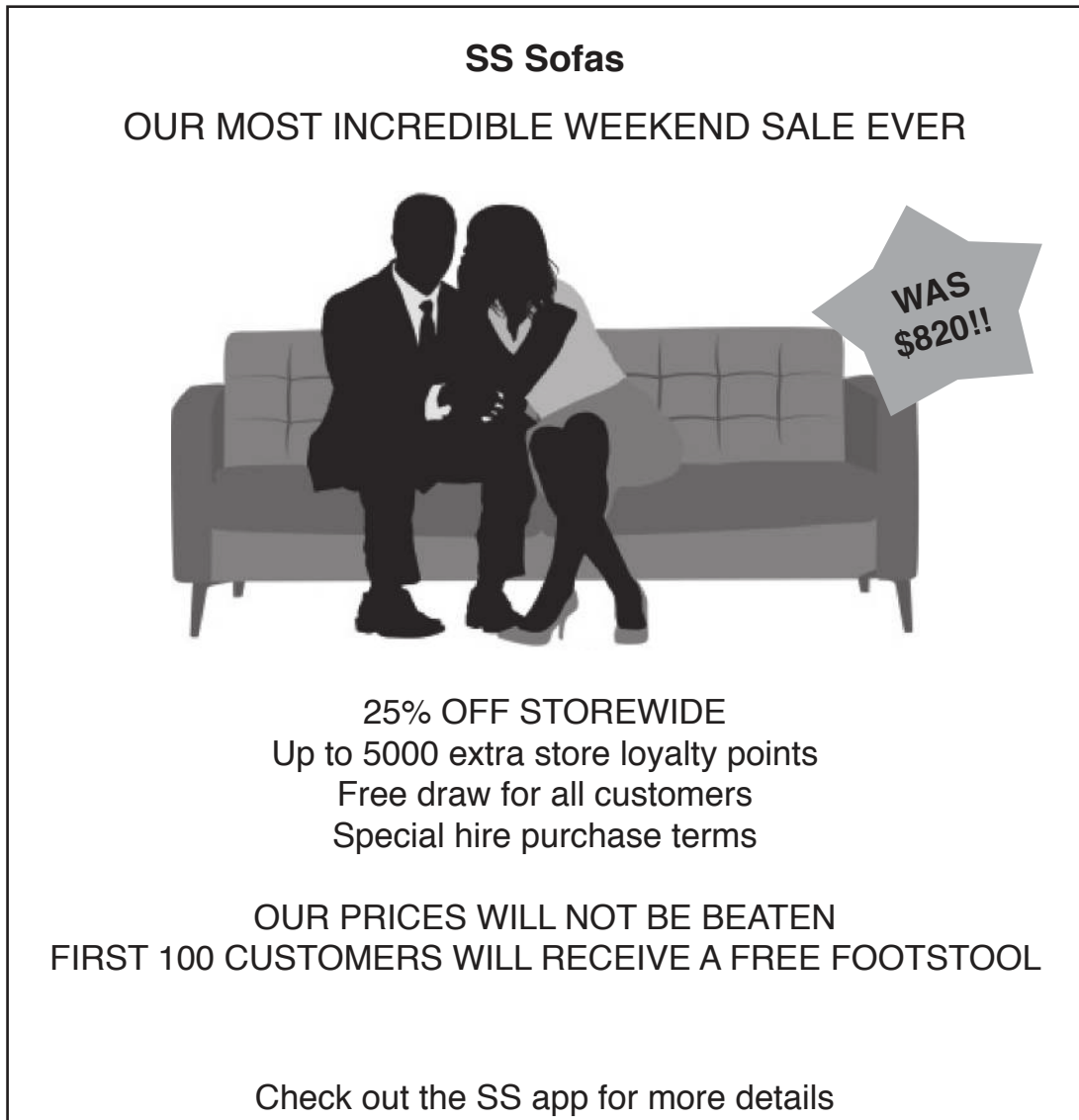
Fig. 3 advertisement

Use Fig. 3 to help you answer the following questions.